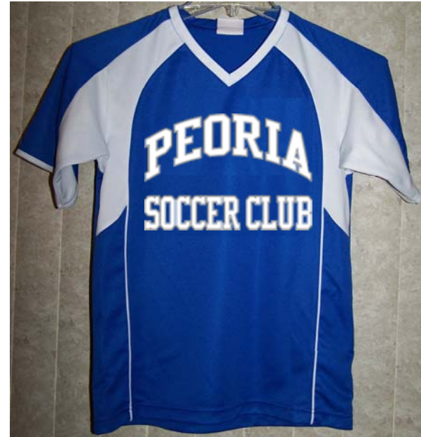
Uniform Set Option